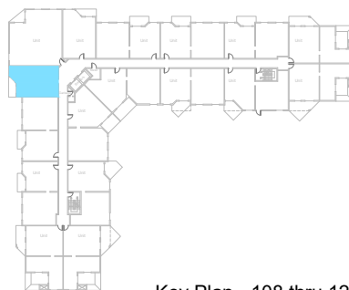
Key Plan - 108 thru 1208