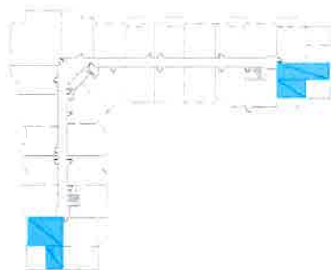
Key Plan - 12th Floor